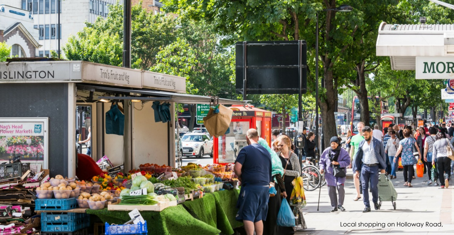
Local shopping on Holloway Road,

DRIVERS & NORRIS PROPERTY & SO MUCH MORE Est 1852