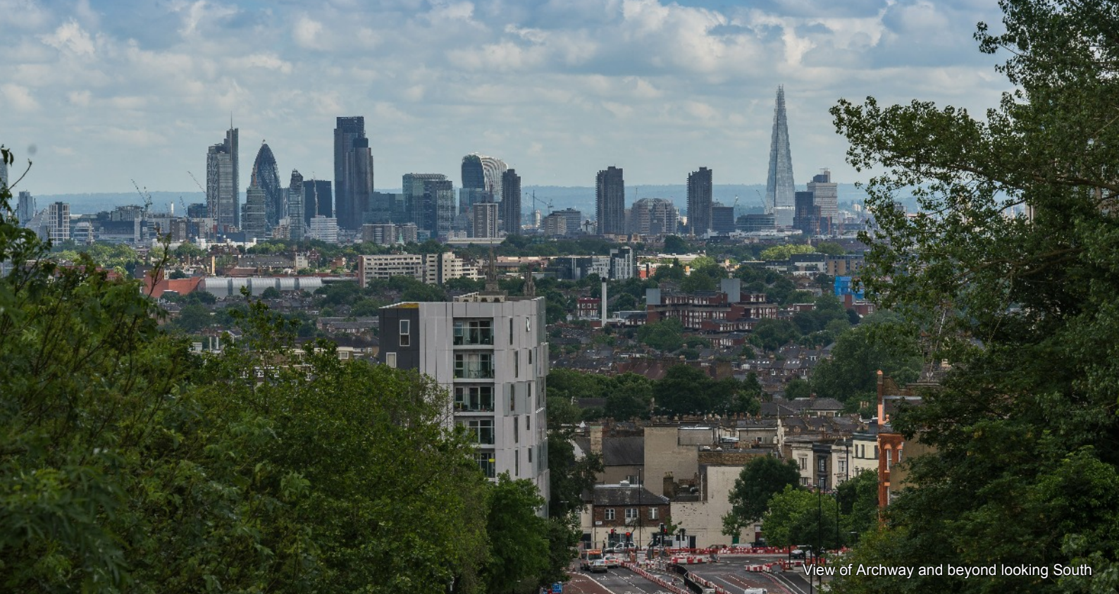
View of Archway and beyond looking South

DRIVERS & NORRIS PROPERTY & SO MUCH MORE Est 1852